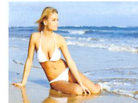
Contour Light will help you get your beach body back without surgery.