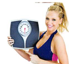
No recovery time and no risk. Contour Light is the perfect alternative to liposuction.

The best part about the Contour Light Treatment is that there are No side effects! There is No bruising, swelling, burning, pain or anesthesia required. Each treatment takes about 25 minutes and you can be back to work.