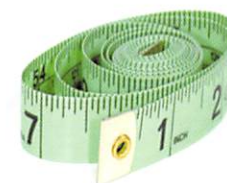
Lose as much as 3 to 12 inches of fat in 3 weeks.