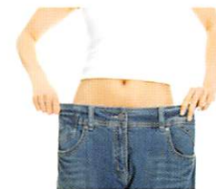
4 treatment pads are used on one area at a time.

Have you done everything to lose those unsightly fat bulges including regular exercise, a healthy diet and weight loss plans, and nothing has worked? If so, then you are in the right place. Contour Light will help you lose inches in the areas on your body that are resistant to diet and exercise.