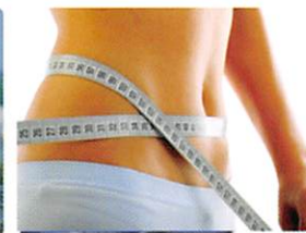
Contour Light will help you get back in your skinny jeans.